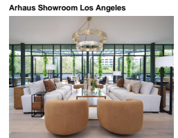
Arhaus Showroom Los Angeles