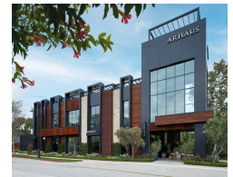
Arhaus Showroom Los Angeles