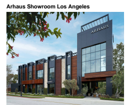
Arhaus Showroom Los Angeles